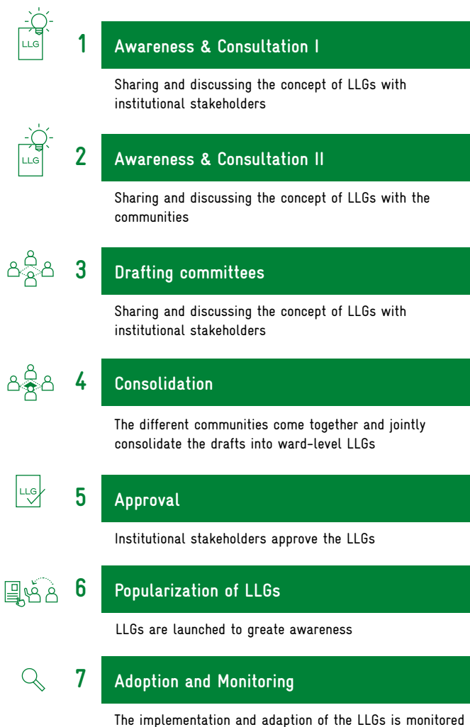
Figure 1: Process of developing the LLGs

The process of developing the LLGs was kick-started in the Isukha West and Isukha Central wards of Kakamega County. It began with workshops to create awareness, encourage buy-in by local stakeholders, and ensure that the guidelines would not contravene any land regulations. Institutions involved in the process included the local administration, the county ministries of agriculture and lands, and the Land Control Board.